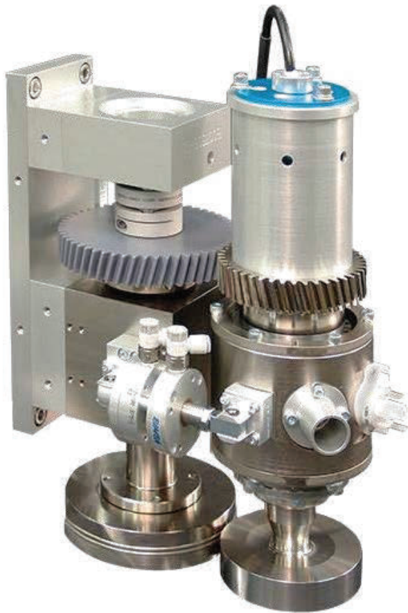
HFFS Top Sealer

Rotary Ultrasonic Sealing Systems for Packaging