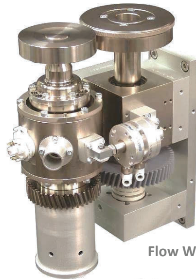
Flow Wrap Fin Sealer